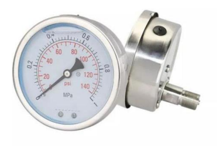
MYBF-X all stainless steel pressure gauge can be applied

in the most corrosive media and conditions, liquid filling helps absorb vibration and pressure spikes, also increasing the service life of the gauge. The parts of this series are made up of cauterization-resisting material. The gauge has good cauterization-resisting performance, can be used widely in petroleum, chemical, metallurgy, mine, power and food industries, measuring the pressure of gas and liquid which have cauterization function to cooper, iron etc.