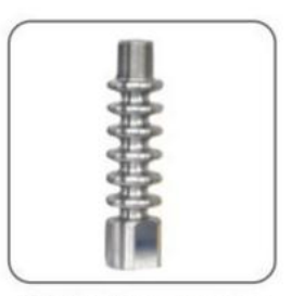
R3 High-Temprature tube