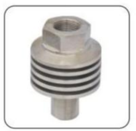
R1 High pressure radiator