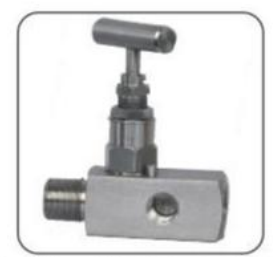
One Valves With A Bleeding Screw